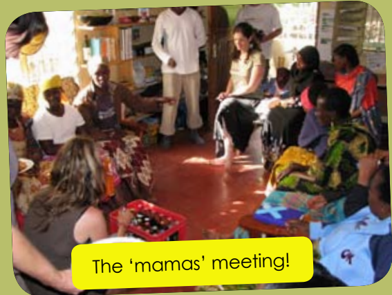
The 'mamas' meeting!

We're charging ahead with training our Tanzanian staff members, setting up the core staff with basic payments (not fully fledged wages yet) to offer some financial stability over the next few months while they train. We hope that you, our supporters, would like to help give financial security to these Tanzanians until Kesho Leo children's village is built and operating. For more info , visit http://www.foodwatershelter.org.au/sponsorships.aspx .