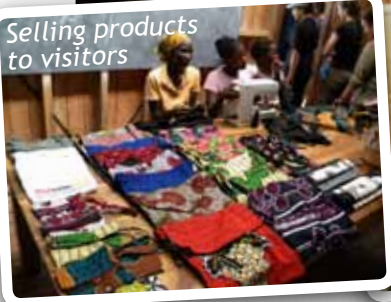
Selling products to visitors