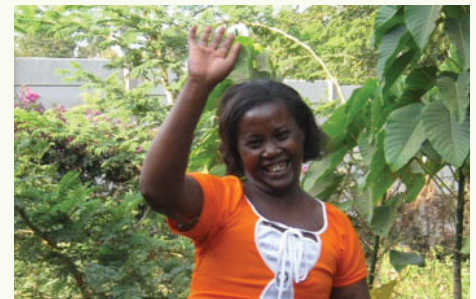
Gladi proudly displaying the improved range of movement she has in her arm, three months after surgery

hug of Gladi's much improved arms, it is the children who receive the greatest gift of love, kindness and compassion.