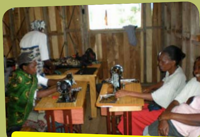
Our house mamas sew up a storm (above) and the boys light up (below).